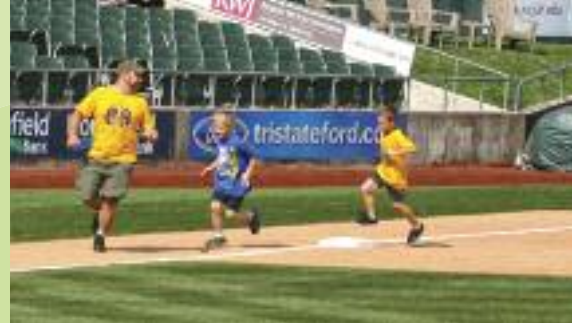
Scouts from Pack 88 in Hopatcong, along with their Cubmaster, stay active and have fun running the bases at a Somerset Patriots' baseball game.