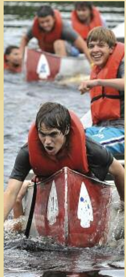
Summer camp offers Scouts the chance to learn outdoor skills and enjoy competition and camaraderie.

Scouts in our area learn these skills through the many programs offered by our council including high adventure trips to the mountains of Philmont in New Mexico and to Sea Base in the Florida Keys. In 2012, 363 Scouts and Scouters participated in these trips. Scouts also benefit from local troop activities and the advancement program.