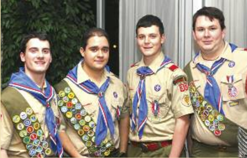
Eagle Scouts from Troop 32, Watchung.